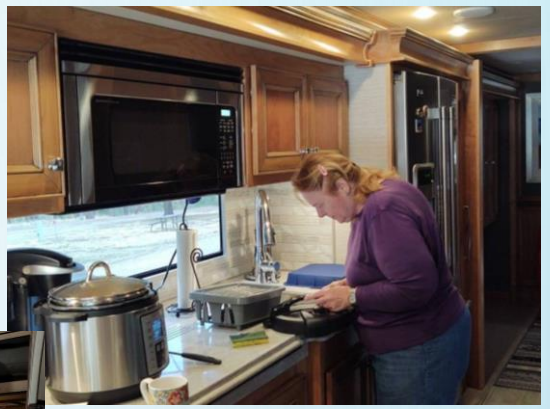
Getting ready for dinner