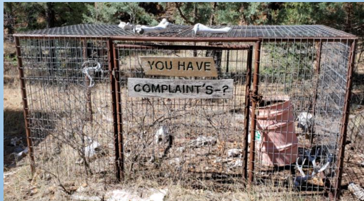
No complaints here, Boss!