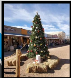
Christmas tree in Benson