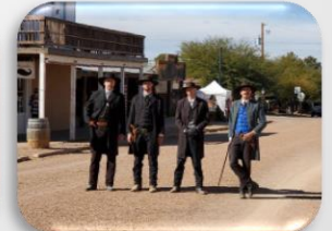
Tombstone: horse coach, OK Corral "dudes" and Wyatt Earp Saloon.