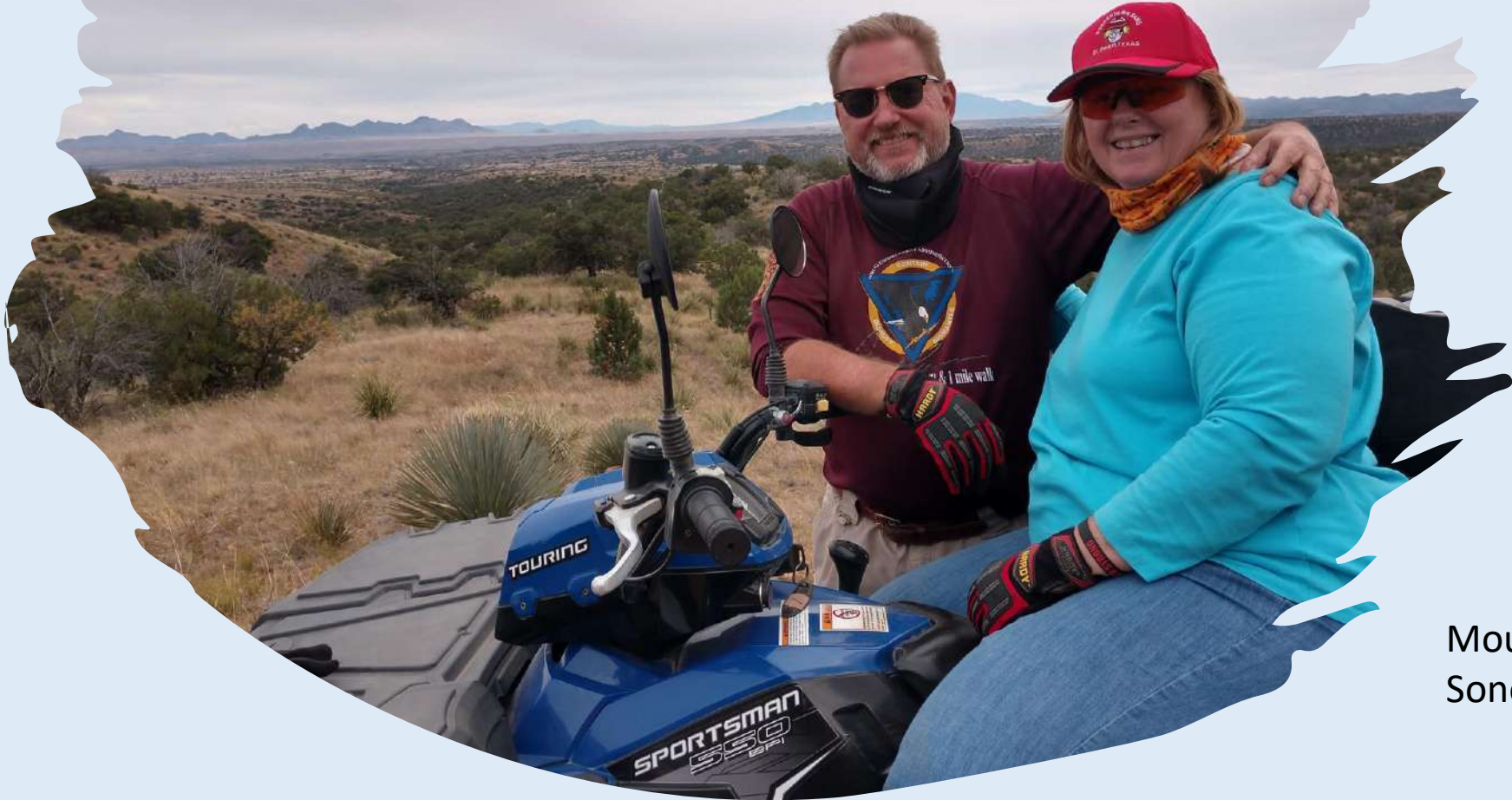
Mount Wrightson, Sonoita, AZ