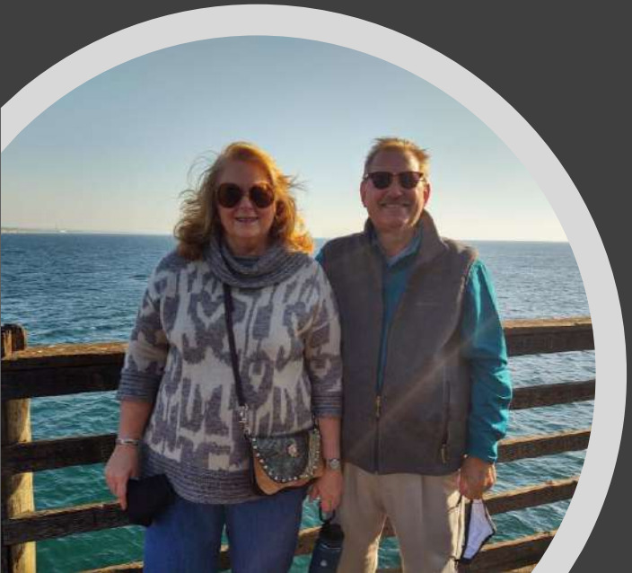
Southern Orange County, CA