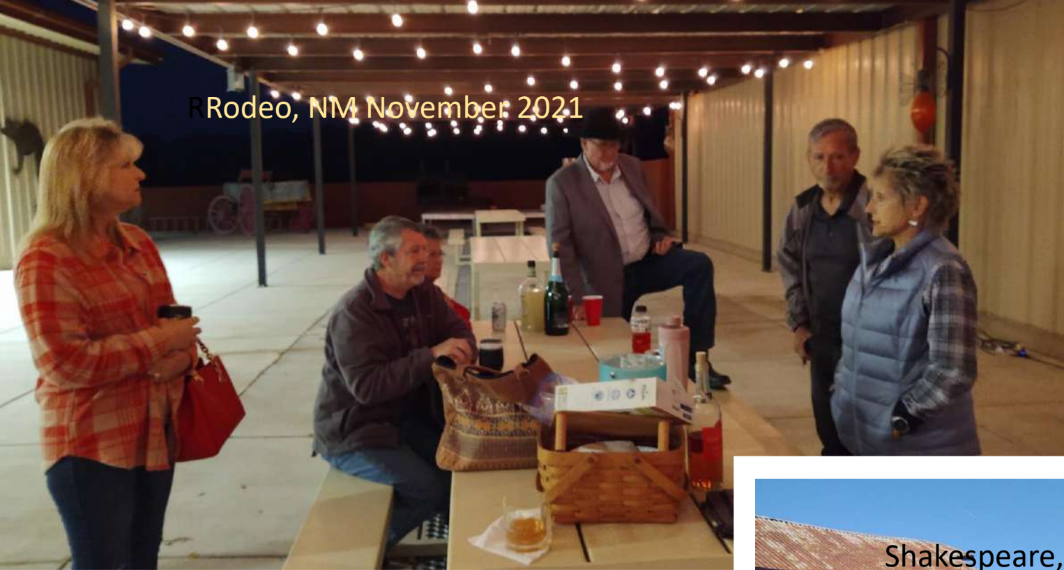
R Rodeo, NM November 2021