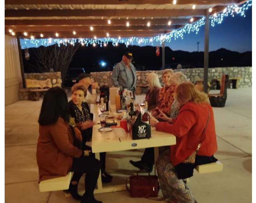
Shakespeare, NM November 2021