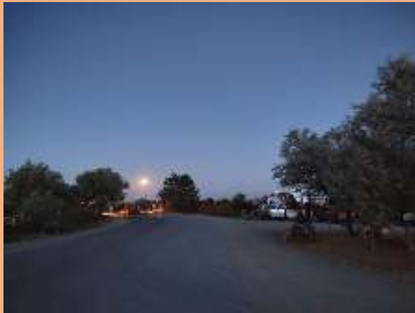
Santa Fe Skies RV Park