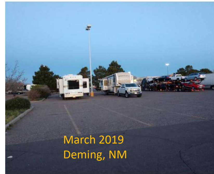
March 2019 Deming, NM