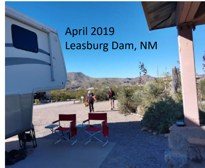
April 2019 Leasburg Dam, NM