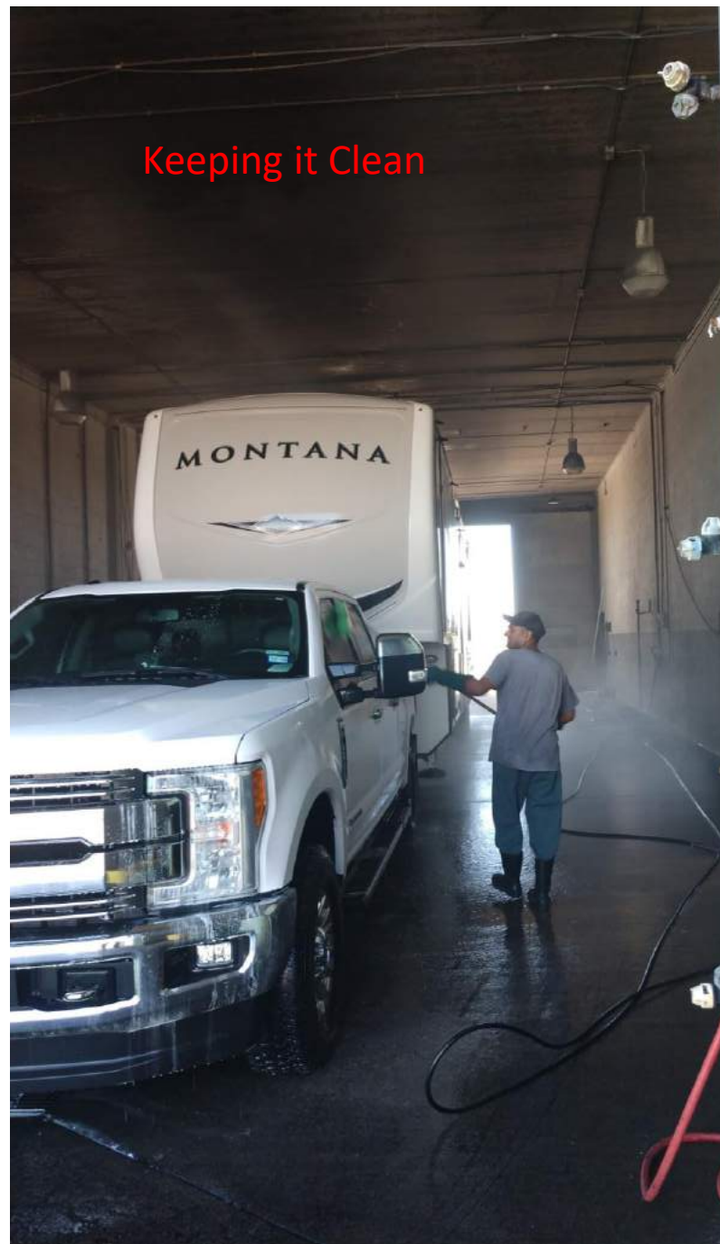
Keeping it Clean