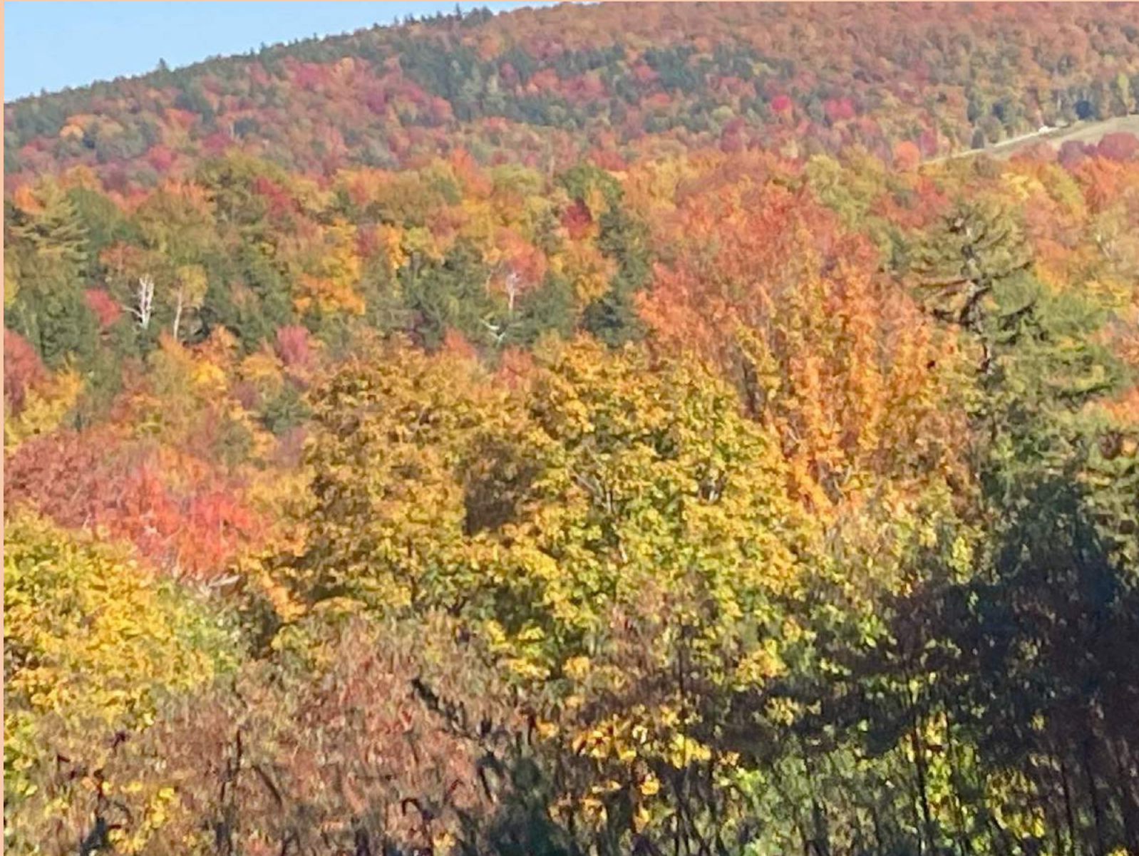
Somewhere in Vermont